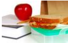
Health Information Exchange Webinar

Wednesday, June 5, 2013 from noon to 1 pm.